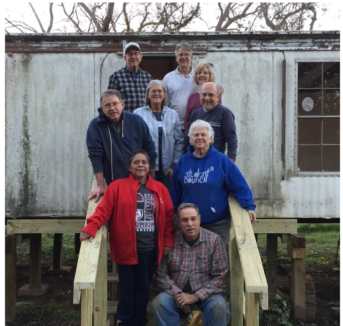
In 2018, part of a Maryknoll Affiliate team with recipient (in red) at her mobile home

Groups were scheduled for months in advance when it was announced at a Mission Council meeting that the facility was to be shut down. We were told that the facility was to be used “for a higher purpose,” and were asked to vacate the property. That was three years ago, but the facility