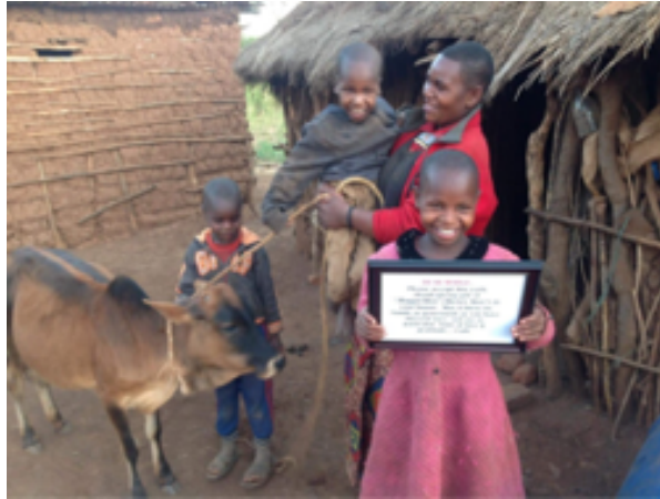
The photo that prodded the gift of a wheelchair