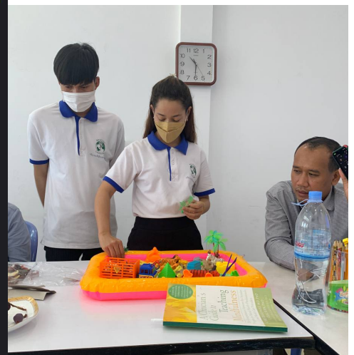
A demonstration video helps explain how patients might express themselves through sand play.

In addition to our satisfaction with this encounter, we hope this specific experience might be a piece of the transformation that the Affiliate Board is considering in recent discussions. As the Board deliberates about the possible futures of the Affiliates, conversations have included moving beyond the chapter meeting model, encouraging action projects, collaborating with the other Maryknoll entities, and going beyond the boundaries of the US chapters. Wider use of technology presents one path to do this. Our small initiative with Cambodian mental health services shows some of this new thinking, a new way to do mission, a way to share our experience and concern.