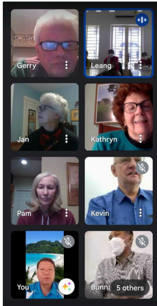
NE Ohio Affiliates connect with Cambodian therapists via Zoom.