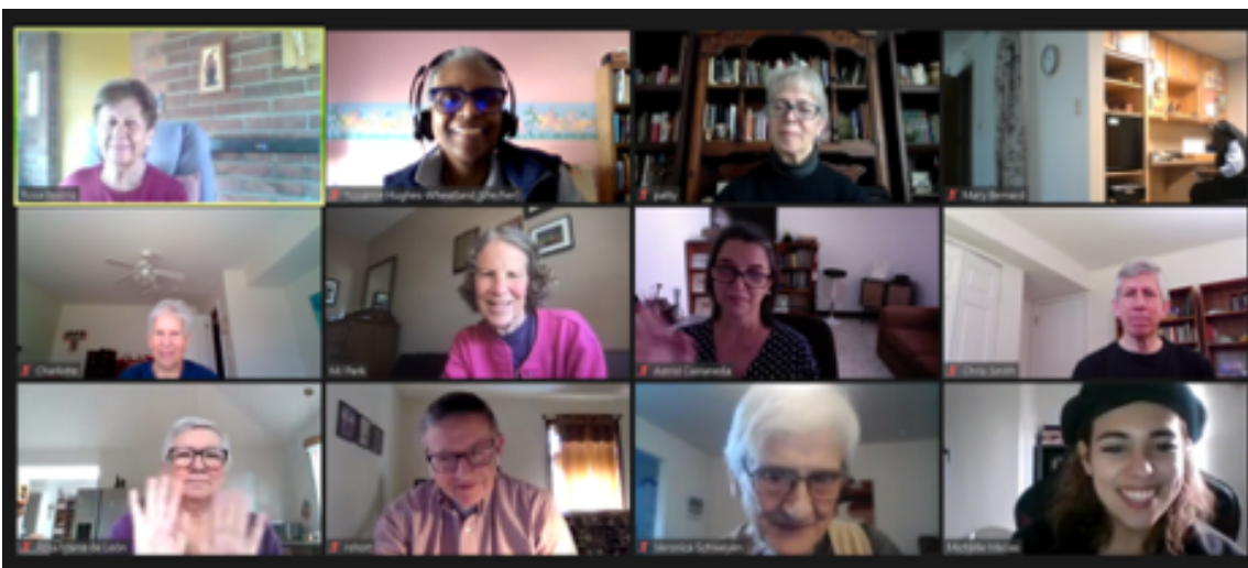
The happy faces of participants tell us that the retreat was well received.