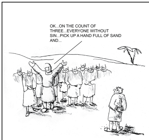
Stonings didn't really work out so great in the desert.