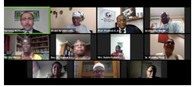
"Zooming" on Sunday (August 16), 19 of us gathered for our Kenyan Maryknoll Affiliate meeting which was able to continue for 80 minutes.