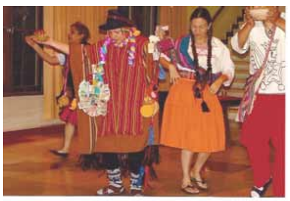
At the Maryknoll Center, we were entertained by a performance of Indigenous dancing.

asked, "What did you do?" my reply is, "We played with the children, giving them our attention. We met with the elderly, showing them they, too, were worthy of our visit. We celebrated the official opening of a specialized wheelchair factory, and we witnessed the beautiful festival of The Virgin of Urkupina." But mostly