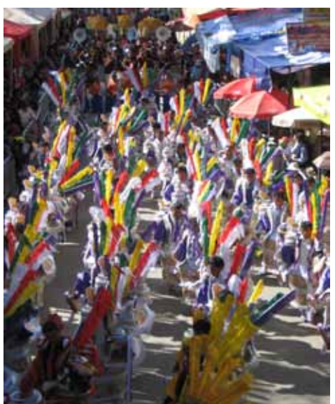
of the Virgin Mary (Fiesta de la Virgen de

answer is: most definitely, yes. Together with other lay mission groups and laity, they walk with the people of Bolivia, offering themselves as a conduit for compassion, justice, and peace to those who are most in need. This is what they do in every country where they serve and in each ministry they choose.