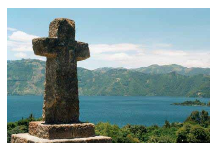
Cross overlooking Lake Atitlan in Guatemala

In contrast to the other countries of the region, Guatemala shows the worst statistics of poverty: more than half the youth are outside of the formal education system, and one in every five children struggle to overcome chronic malnutrition.