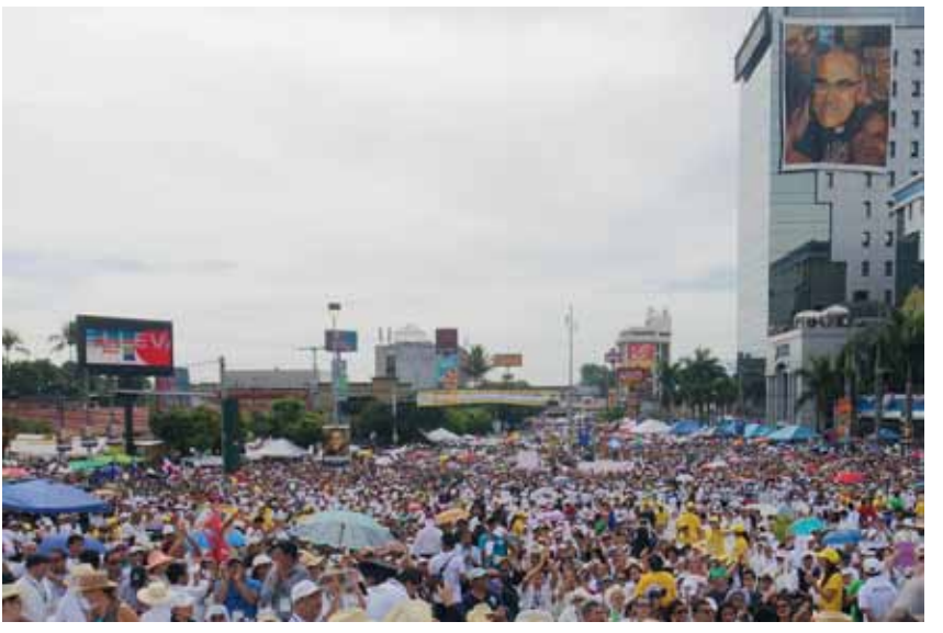
Multitudes congregate in San Salvador during the beatification ceremonies.

campesinos from El Salvador, congregated for the vigil Mass. For the Salvadoran campesinos, this had been a mostly dry "rainy season," and the pouring rain was a blessing. As the vigil Mass continued, I sought refuge from the curtains of water in the midst of the sea of people around me. Soon I made eye contact with an old lady who was standing under her umbrella. Most likely my look made her signal me to join her. Not too