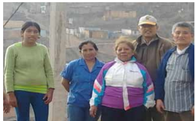
La ayuda de los pobres para los mas pobres. – Help from the poor for the poorer.

We hope to reconnect with several of these new Affiliates through Facebook and at the 2014 MAC.