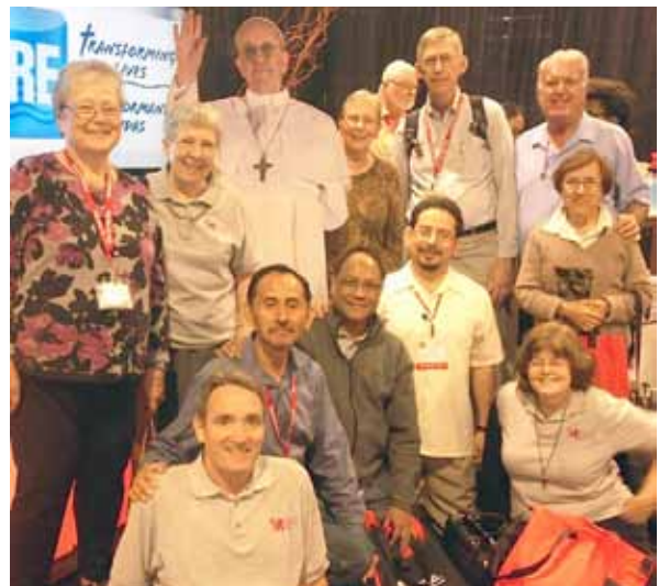
Photos taken at Congress, including this one of Affiliates "gathering with" Pope Francis, may be viewed on the LA Maryknoll Affiliates' Facebook page at: https://www.facebook.com/pages/Maryknoll-Affiliates-Los-Angeles/149679705071707