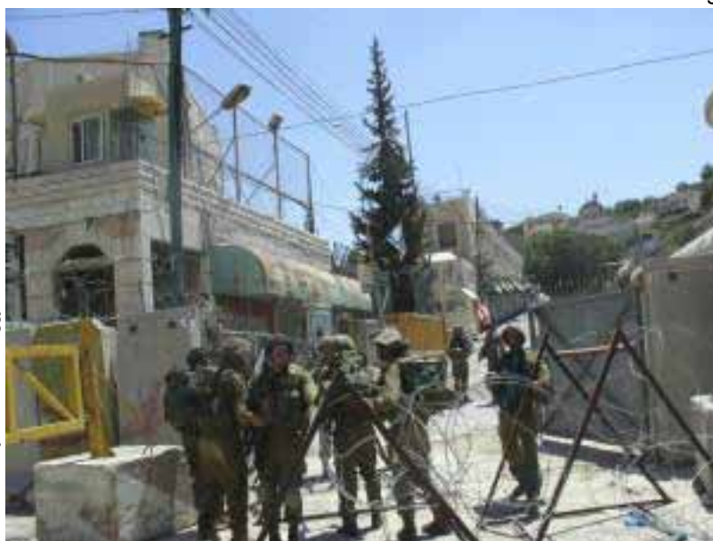
IDF Soldiers Returning to Their Base Next to the Suuq