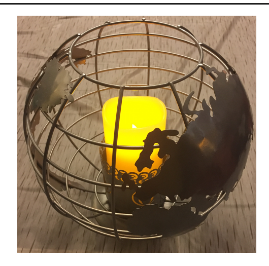
Ginny McEvoy provided an Earth candle centerpiece to focus the group's thoughts. during the Board meeting.

What Actions are you and your chapter pursuing?