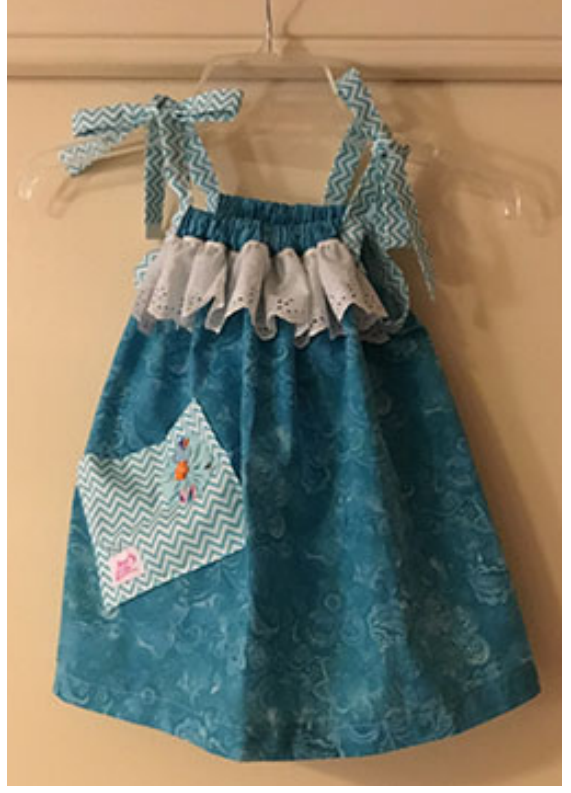
Some Dress-A-Girl Recipients