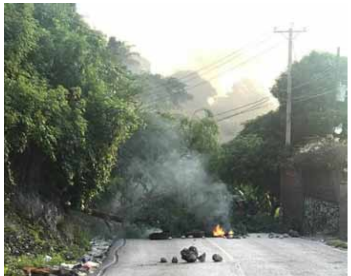
Roadblock between Jeremie and Port au Prince.

How did it get to this? The uprisings, which have lasted since summer, are caused by huge frustrations; life is ever more difficult to live. Devalued local currency, skyrocketing inflation, increased malnutrition and widespread hunger, huge unemployment and massive corruption by political leaders of all parties have contributed to the current crisis.