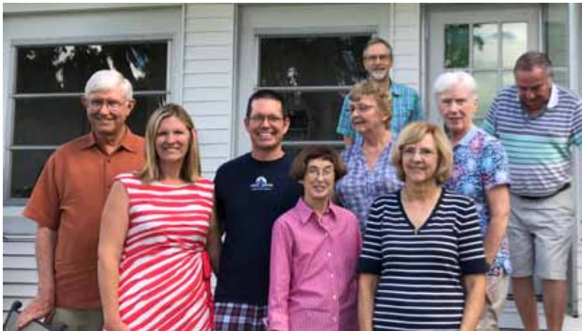
Most of the Northeast Florida Chapter