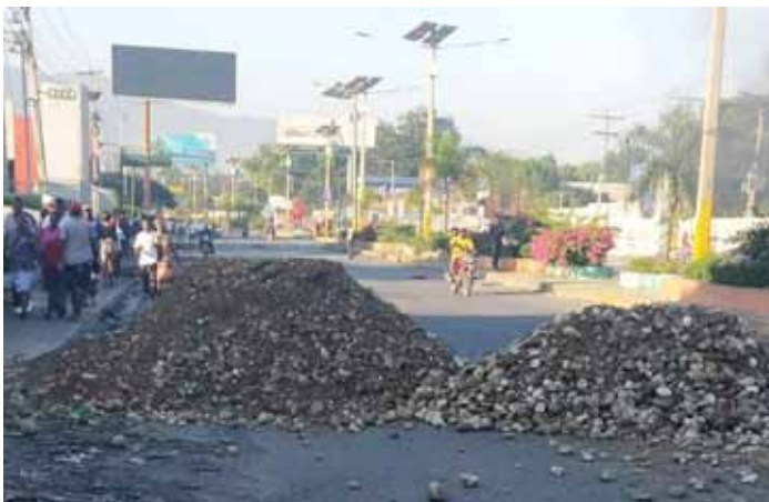
Roadblock in Jeremie on the way to the airport.

I found myself angry with the bandits, because they destroyed the livelihood of their mothers and grandmothers, and they hurt themselves in a way too, because when they went home, there was nobody who would cook for them. Roads to leave Jeremie were constantly blocked, and I was afraid that the road to the small airport in Jeremie would also be blocked. I wanted to be home in Chicago for Christmas.