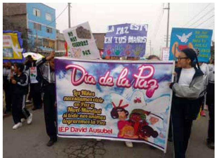
Their signs read: “No More Wars—Peace,” “Peace is in Your Hands,” “Children need to live in worldwide peace. If we all come together, we will achieve peace.”