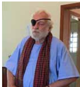
KVAO founder talks to group.

grateful for the services of KVAO: they greeted him when he arrived and helped him find a place to stay and obtain job training. He can never return legally to the US, so to maintain contact, his family will have to visit him in Cambodia.