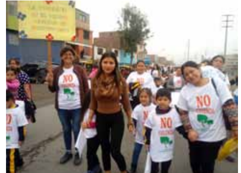
Find out whose March for Nonviolence grows each year on page 5.