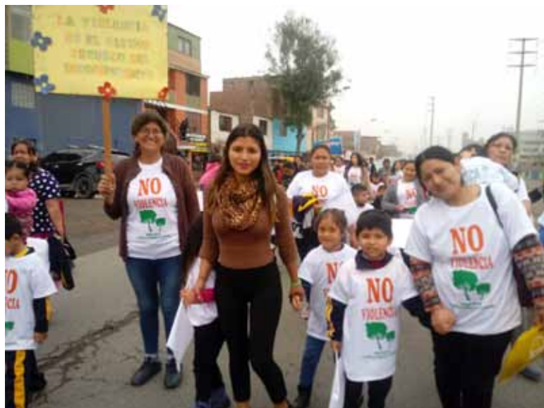
Her sign reads, “Violence is the Last Resort of the Incompetent.”

people see the march as an opportunity to pronounce themselves united against crime, to reject any act of violence against women, children, the elderly and animals, and to reject any act that destroys the Mother Earth.