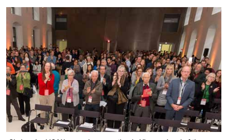
Six hundred ICAN campaigners gather in Vienna ahead of the conference.

This prayer service is derived from Pax Christi International's Interfaith Prayer Service for Nuclear Weapons Ban Treaty Negotiations, conducted on March 28, 2017, at the Isaiah Wall, NYC. Your chapter might use it at a chapter meeting or arrange an interfaith prayer service in your area.