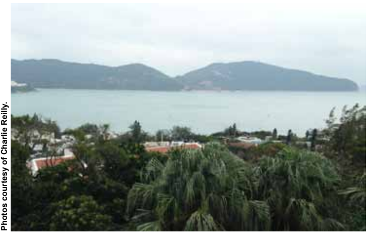
View from the Maryknoll House to the South China Sea