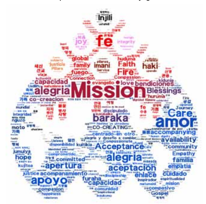
This word-cloud of the Maryknoll Affiliate logo is made up of words provided by respondents to the survey, shown in the languages of countries where Affiliates are located.

How would you see us cultivating your vision for the future of the Maryknoll Affiliates? Chapters connecting through regular reporting to the Chapter's website page. ... help each other get up to speed on use of the website, social media, leadership [skills] ... Connect us with the missioners via podcasts, Skype, ... mission opportunities in the US ... preparing others who are going on mission and then helping them process their experiences when they get back.