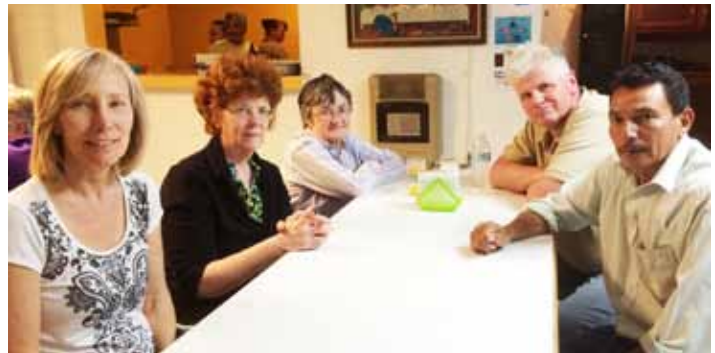
Affiliates met with migrants at a center in Agua Prieta, Mexico. The migrants had walked or taken trains to the border, being extorted for money. Across the border, many would be picked up and returned to Mexico. Many migrants appeared fearful, traumatized by the journey.

Dialogue between all the different persons involved in immigration opens up space for growth, deeper understanding and change. It was fascinating to see how the sisters facilitated this conversation, promoting respect and building bridges between folks with different perspectives.