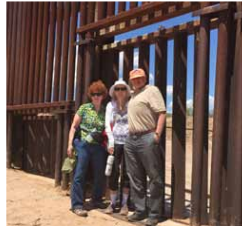
Who hiked to the far side of the wall between Mexico and Arizona on a trail frequented by migrants? Find out on page 3.