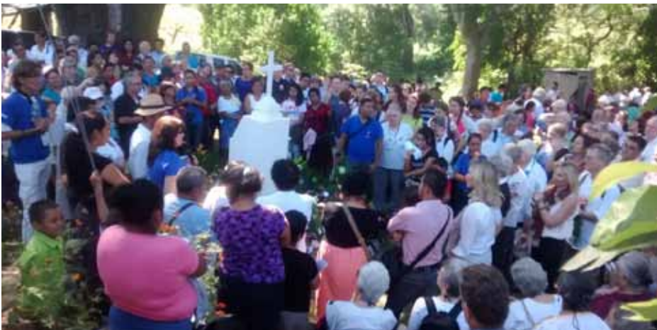
About 500 people gathered for the Remembrance at the monument to the martyrs.