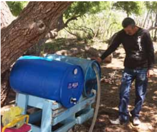
Filling water tanks in the desert at CRREDA, a rehabilitation center in Agua Prieta, Mexico.

The most exhilarating reality was the compassion and kindness