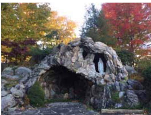
This inspirational grotto of the Blessed Virgin graces the grounds of the Maryknoll Sisters in Ossining, NY.