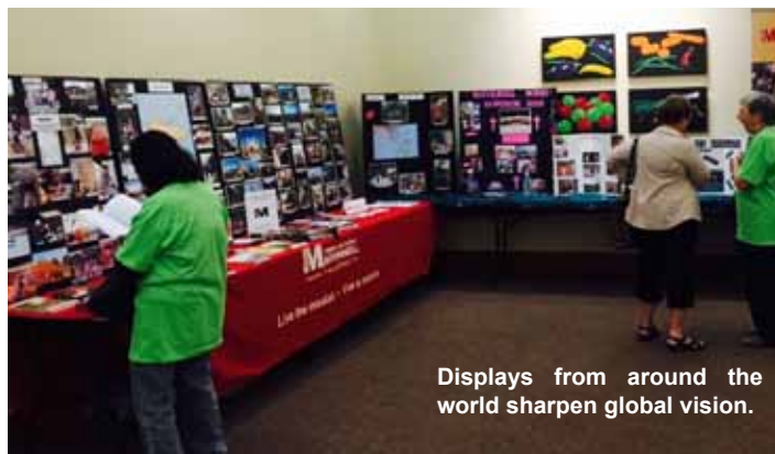
Displays from around the world sharpen global vision.