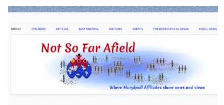
Notsofarafield.org, the online site for our Affiliate newsletter, uses a blog platform; comments are welcome.

Blogs are a great way to tell your story. You can relate mission stories and include photos and videos. Allowing readers to comment on your blog post can begin dialogues and be a forum for new ideas.