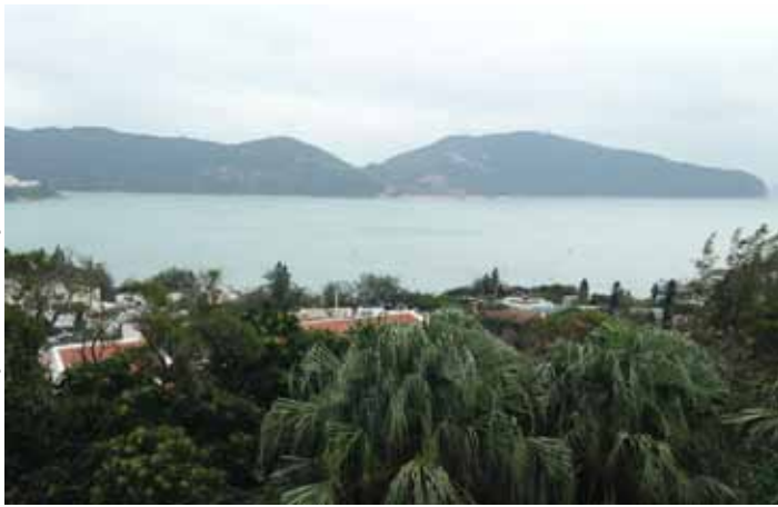
View from the Maryknoll House to the South China Sea