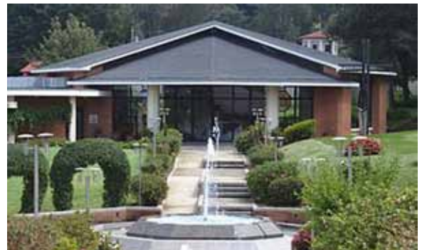
Casa de Retiros Verbo Encarnado, Guatemala, site of MAC 2017