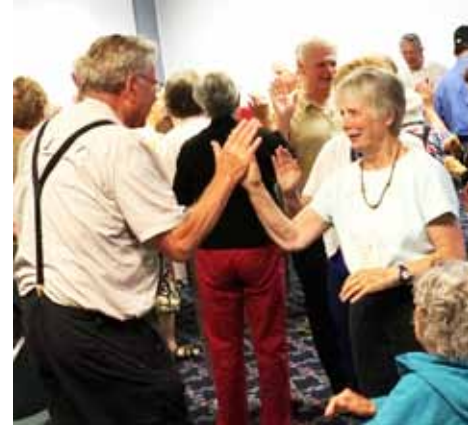
What are the “High Fives” about? See page 4!