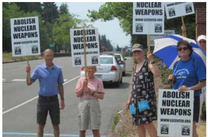
Three police cars join the vigil.

During our brief vigil, we held up signs for passing cars urging, “Abolish Nuclear Weapons.” Mary cautioned us to not cross the blue line on the pavement marking the edge of federal property. Crossing would be considered criminal trespass. We had stood in the