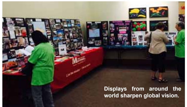
Displays from around the world sharpen global vision.