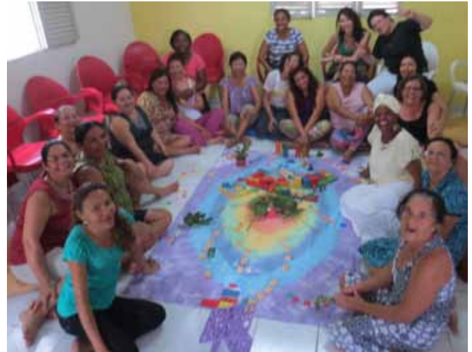
The Women of Afya at an all-day staff training I helped facilitate.