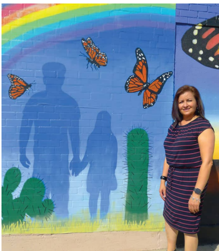
Picture yourself working virtually at this volunteer's side.