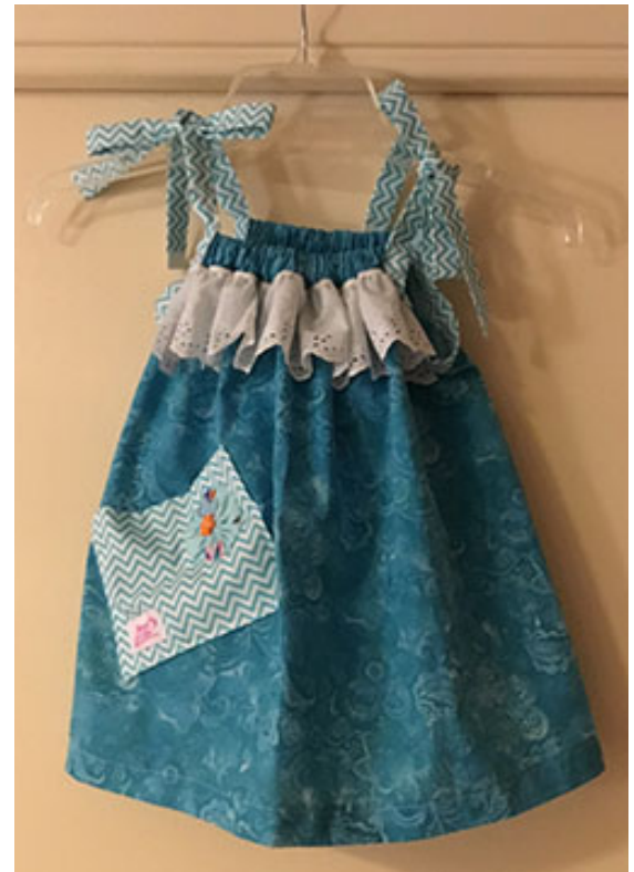
Some Dress-A-Girl Recipients