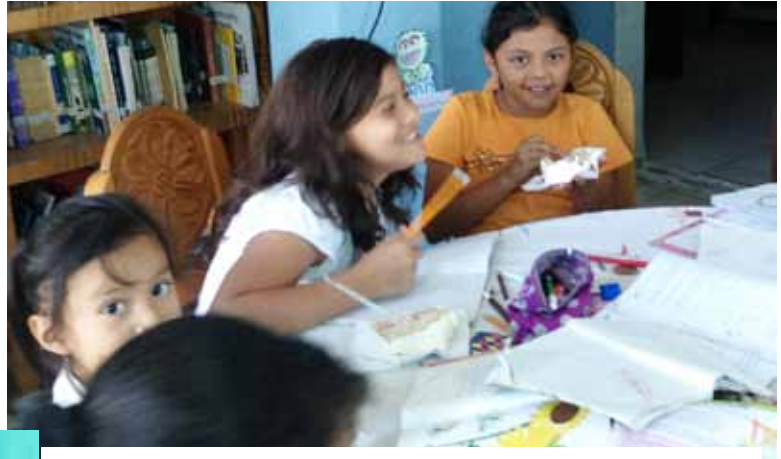
After a nutritious meal, students enjoy the tutoring session.

The Las Vegas Affiliate Chapter has also done a great deal. First, they sponsored one of our children. Later,