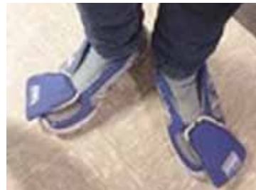
Whose shoes are these and what do they have to do with anything? Find out on pages 6-7.