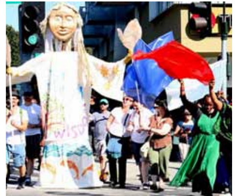
How to make Peace on Palm Sunday? See p. 6.