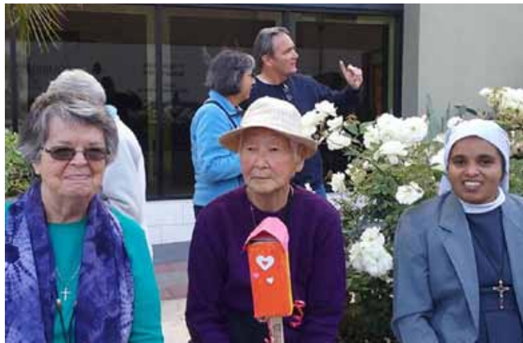
Two of the Maryknoll Sisters, and another sister who lives with them while studying, held one of the houses the LA Chapter made in readiness for the parade.

With the aim of not only raising homelessness awareness, but also ending it entirely, the march calls for rent stabilization and an increase in accessory dwelling units (“granny flats”), as well as policies like Housing First that can end chronic homelessness.