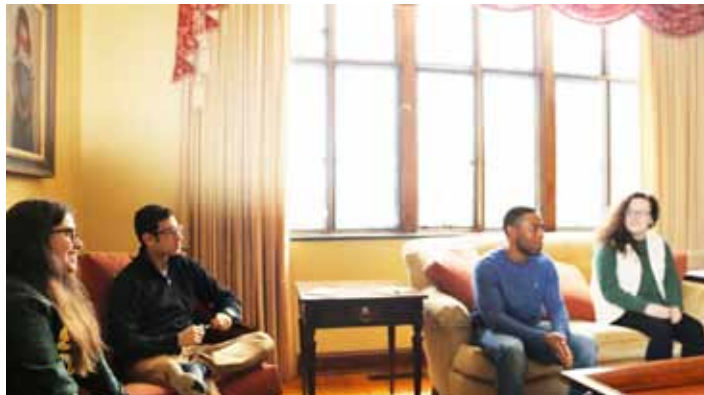
Students reflect on their immersion experiences.