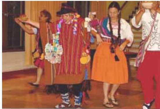
At the Maryknoll Center, we were entertained by a performance of Indigenous dancing.

asked, “What did you do?” my reply is, “We played with the children, giving them our attention. We met with the elderly, showing them they, too, were worthy of our visit. We celebrated the official opening of a specialized wheelchair factory, and we witnessed the beautiful festival of The Virgin of Urkupina.” But mostly