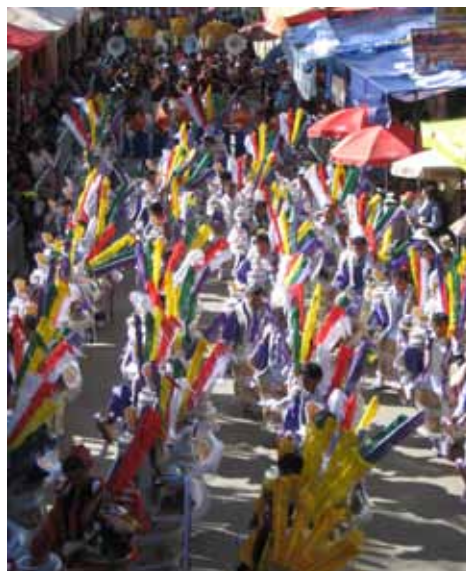
In Quillacollo, the Feast of the Assumption of the Virgin Mary (Fiesta de la Virgen de Urkupiña) is celebrated with a parade.

answer is: most definitely, yes. Together with other lay mission groups and laity, they walk with the people of Bolivia, offering themselves as a conduit for compassion, justice, and peace to those who are most in need. This is what they do in every country where they serve and in each ministry they choose.