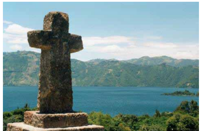
Cross overlooking Lake Atitlan in Guatemala

In contrast to the other countries of the region, Guatemala shows the worst statistics of poverty: more than half the youth are outside of the formal education system, and one in every five children struggle to overcome chronic malnutrition.