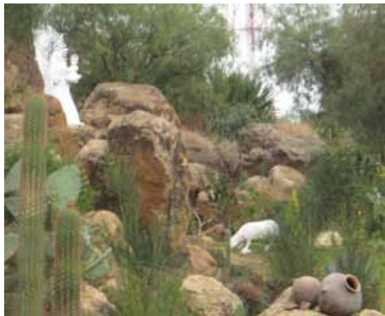
Calvario (the hill) in Quillacollo is a holy site where the Virgin Mary appeared to a shepherd girl; citizens journey here on pilgrimage prior to the parade.

This FAB trip was truly an immersion trip. We enjoyed traditional food as we ventured from the urban sprawl of Cochabamba to the more rural towns of Tarata, Cliza, and Punata, each with its own distinctive flavor. We were fortunate to be in Quillacollo for the feast of the Virgin of Urkupina, visiting her famous shrine before the hordes of pilgrims arrived for this most important celebration.